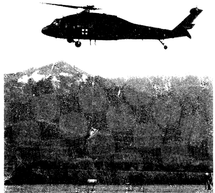
SAR volunteers guide tag line as gurney is hoisted into helicopter during December training

Silver Star's new snow cat, donated in 1995 by the F.A.A., made its debut during cooperative training with other area SAR teams during a winter survival training weekend. Our snow cat transported 18 SAR volunteers and all their gear to advanced base camp as well as compacting deep powder snow to make it passable for snowmobiles. This past summer the snow cat was equipped with a snow plow blade to further increase its capabilities. We look forward to utilizing our snow cat during Snow Patrol duties on Mt. St. Helens and for snow rescue and transport services anywhere it is needed in Clark, Skamania or Cowlitz counties.