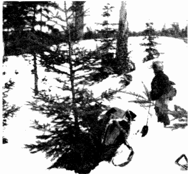
Snowmobile mishaps such as this provide SAR personnel with special challenges during Snowmobile Safety Class

This winter Silver Star was invited to help with race course communications and safety during a hundred mile sanctioned snowmobile race, the Lone Butte 100, near Lone Butte Sno-Park north of Carson. We were able to position our Snow Cat in a central location and run radio communications throughout the entire race course. The racers all safely completed the course and a great time was had by racers and spectators alike.